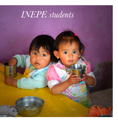
The new refectory